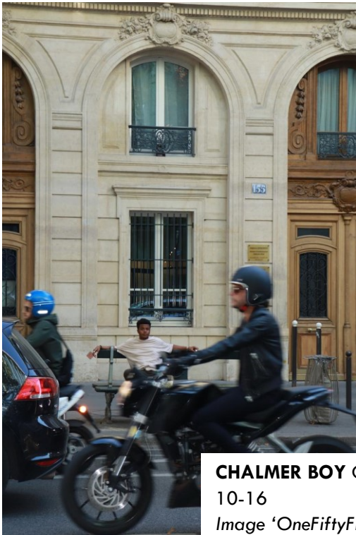
CHALMER BOY ON Pg. 10-16 Image 'OneFiftyFive' Cover